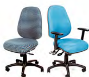
GRANDE +, 18